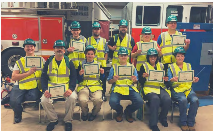
Pictured above: The Fall 2019 CERT Basic Training class.

In 2020, there will be a new training option for those who want to complete CERT basic training without having to spend 20 hours in a classroom. In addition to the traditional classroom course, there will be a hybrid option to allow much of the course to be taken online. The online learning experience will include videos, quizzes, and writing exercises. Then participants will attend a one-day hands on training that will focus on mastering the skills discussed in the online training. Completion of the online portion and hands-on training day qualifies students to participate in a final exercise and receive their CERT Basic Training certificate of completion.