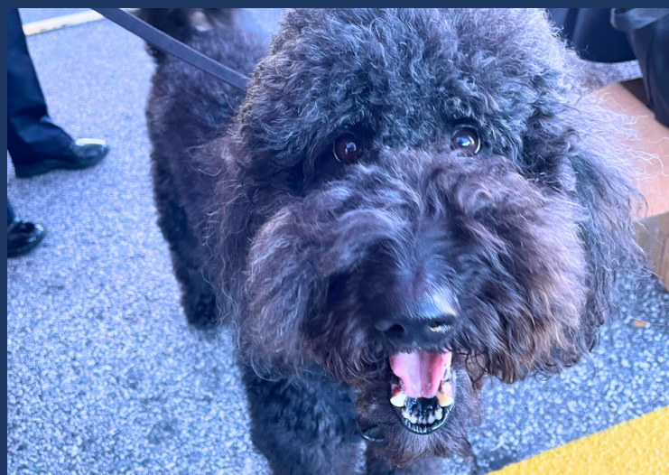
GREenville COUNTY SHERIFF'S OFFICE DEPUTY DALLEY