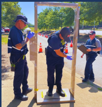
PORTAL MONITOR CHECK