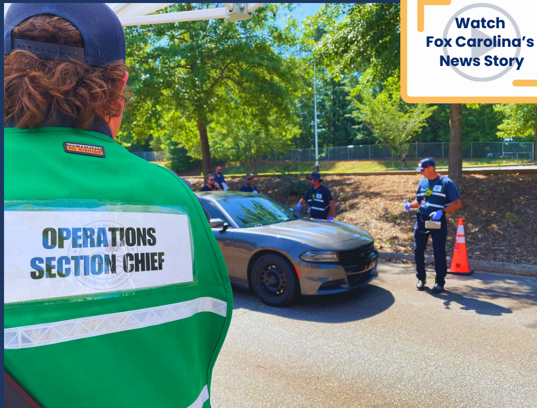
HANDHELD MONITORING OF VEHICLES AFTER THEY'RE DRIVEN THROUGH THE PORTAL