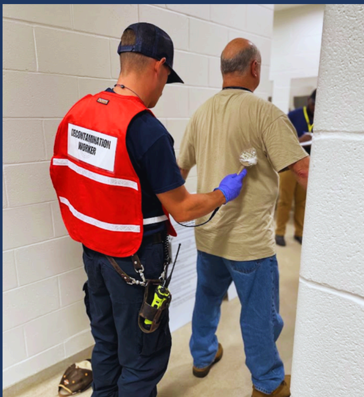
EVACUEE MONITORING AFTER DECONTAMINATION