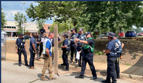
VEHICLE MONITORING SETUP