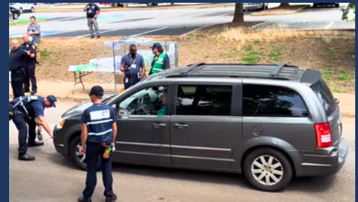
VEHICLE MONITORING HANDHELD CHECK

Greenville County is a Host County for the Oconee Nuclear Station, which means it accepts evacuees from Pickens County around the plant in case of an emergency. In October 2022, Emergency Management began writing a new Radiological Standard Operating Guide to include the four reception centers. These centers serve as temporary shelters for Pickens County residents in the event of a radiological release at the Oconee Nuclear facility. Previously, each reception center had its own plan, created by the hosting fire departments. By developing a standard guide for monitoring, decontaminating, and sheltering for all reception centers in the county, emergency personnel can receive consistent training on these processes, ensuring uniformity throughout the county. On June 21, 2024, emergency personnel in Greenville County demonstrated the Radiological Standard Operating Guide for the first time at Travelers Rest High School, which had not been previously tested. The effectiveness of the guide was evaluated by FEMA, which reviewed the techniques and processes demonstrated in the case of a radiological release. After the exercise, FEMA evaluators praised the efficiency of the new Radiological Standard Operating Guide and the emergency personnel's well-executed process during the evaluation.