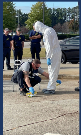
IMAGES ABOVE ARE FROM THE 2023 BERA HIGH SCHOOL RADIOLOGICAL EXERCISE