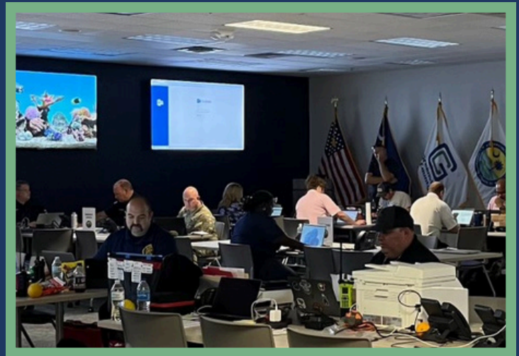
Hurricane Helene is the first activation of Greenville County's new Emergency Operations Center