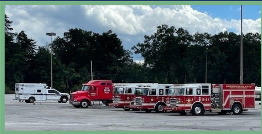
Greenville City Fire Engines

When Helene reached South Carolina as a tropical storm, it caused extensive wind damage and power outages as numerous trees and power lines were downed. On Friday, September 27, 2024, the EOC moved to OPCON 1. Swiftwater rescue teams were deployed, and search and rescue efforts commenced. Greenville County received assistance from SC-Task Force 3, 4, & 5, LA-Task Force 2 & 3, and CA-Task Force 5. Fire engines and crews were also brought in from N. Myrtle Beach, Horry County, Florence County, St. John's, St. Andrew's, and Howe Springs Fire Department, and EMS crews from Berkeley, Charleston, and Dorchester County to bolster response efforts. Nearly all of Greenville County experienced power and internet outages lasting