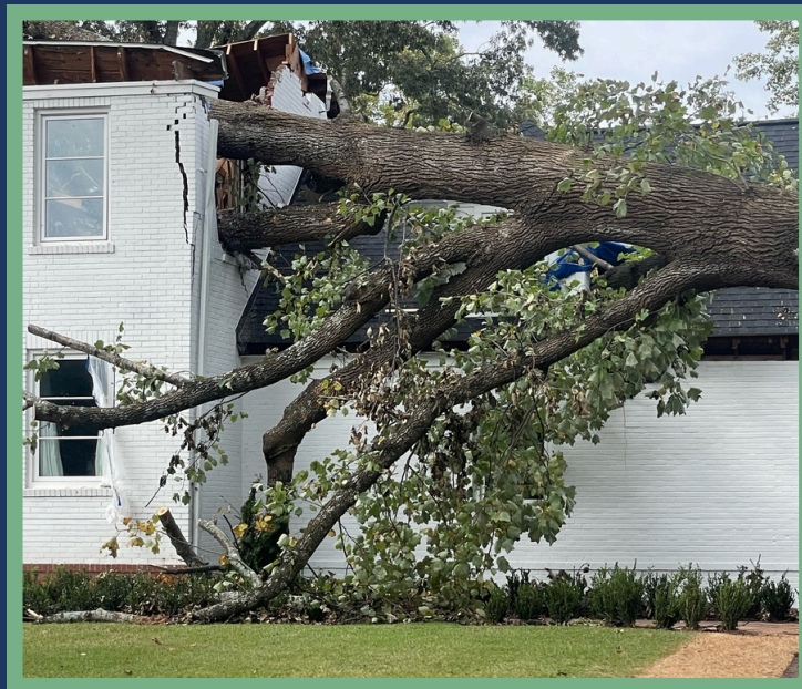
Tree damage to Greenville County residence

Emergency Management collaborated with various non-profit organizations, including Meals on Wheels, LiveWell, Salvation Army, United Way, and the American Red Cross, to deliver food and water to citizens in need. After the storm passed through Greenville County, Emergency Management was able to establish several Disaster Survivor Assistance Teams and Disaster Recovery Centers, working alongside SCEMD and FEMA to help residents apply for disaster assistance. Despite the unprecedented severity of the storm and its devastating consequences, the citizens of Greenville County demonstrated remarkable resilience. Greenville County Emergency Management would like to thank all of our partners across the county and state for their assistance in what is most likely the largest disaster this state has seen since Hurricane Hugo in 1989. The relationships and partnerships Greenville County built during the Helene response will continue to enhance our preparedness for future incidents.