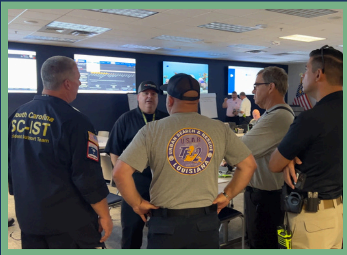
Louisiana Task Force 2 speaks with members of the EOC