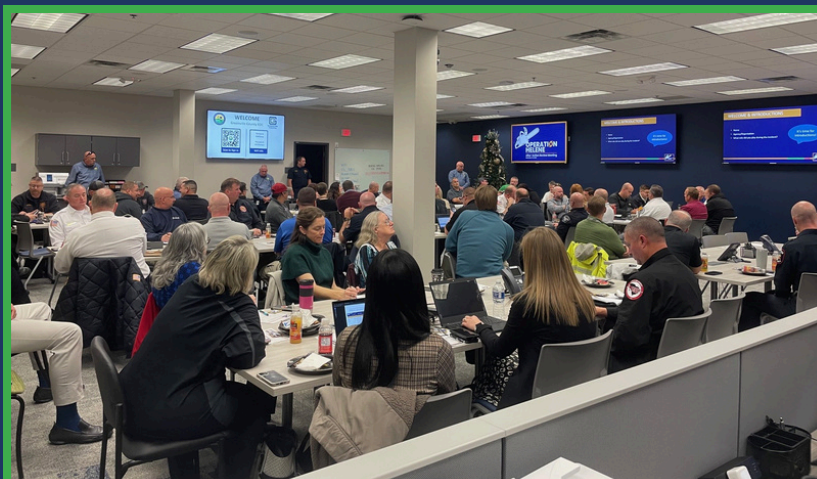
GREENVILLE COUNTY AAR PARTICIPANTS