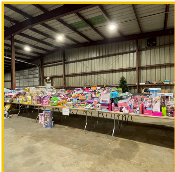
TOY SORTING AT THE LEO SANTA WAREHOUSE