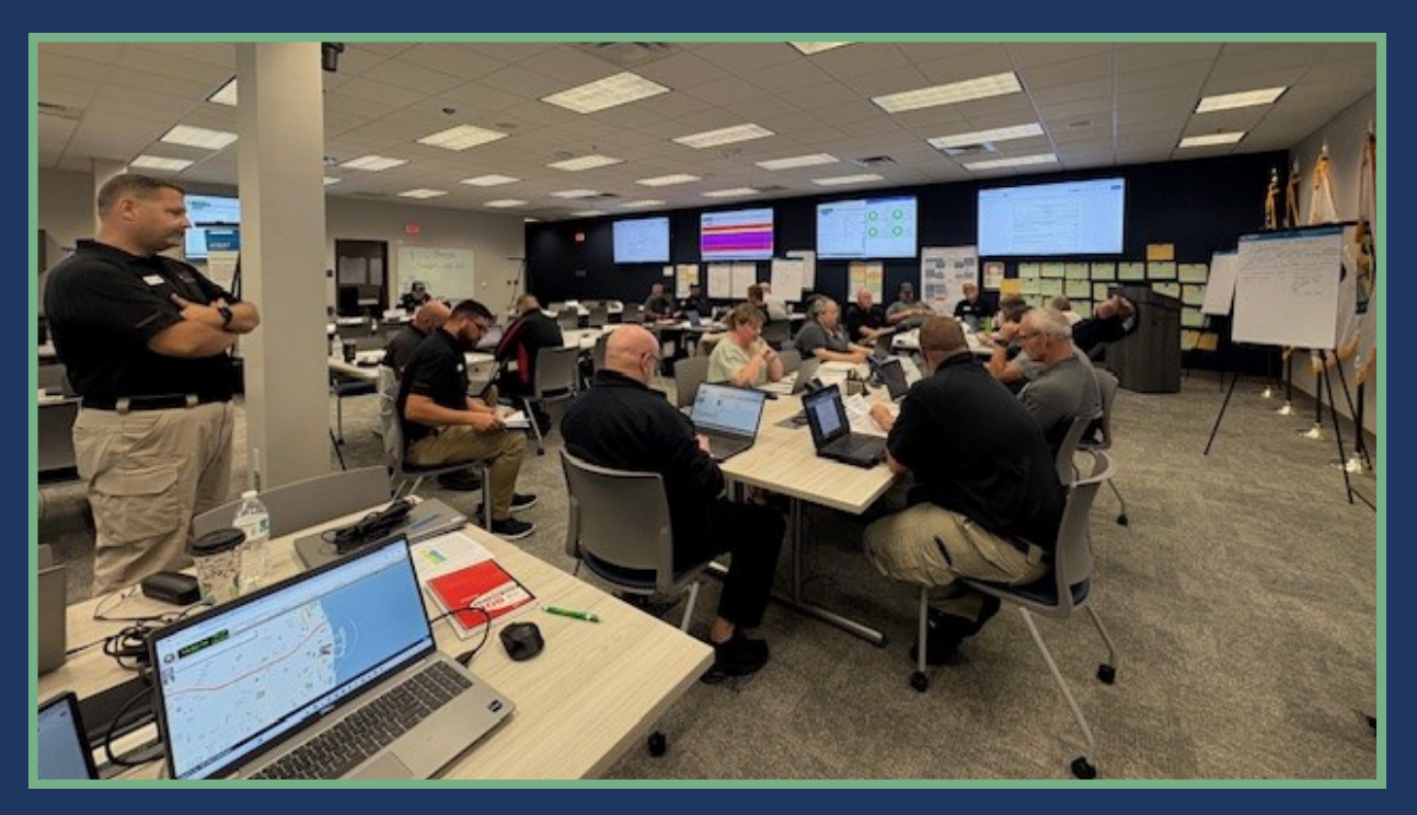
For more information on future training in Greenville County, or to sign up for the training newsletter

This course provided personnel who could be assigned to or work in an Emergency Operations Center (EOC) the skills necessary to effectively plan for and manage largescale incidents by applying and implementing an all-hazards, multi-disciplinary, management team approach. The course placed special emphasis on planning, resource, and information management processes.