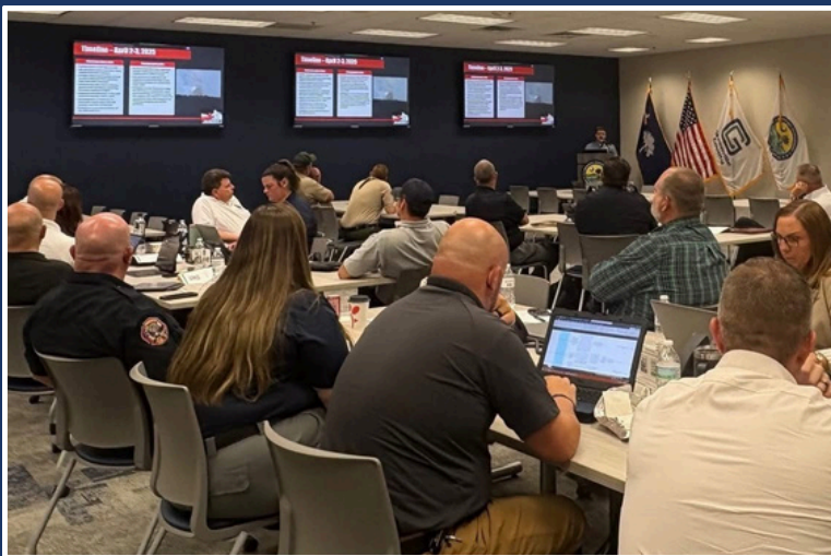
TABLE ROCK COMPLEX FIRE AFTER ACTION REVIEW

July 24, 2025, Greenville County Emergency Management hosted the Greenville County Table Rock Complex Fire After Action Meeting. This meeting allowed us to review the incident, identify lessons learned, and strengthen collaboration across agencies for future emergency responses. The discussion fostered a shared understanding of successes and challenges.